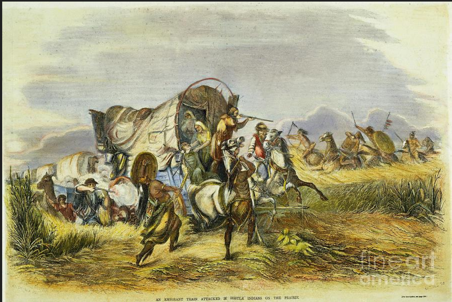
AN EMIGRANT TRAIN, ATTACKED BY HOSTILE INDIANS ON THE PRAIRIE.